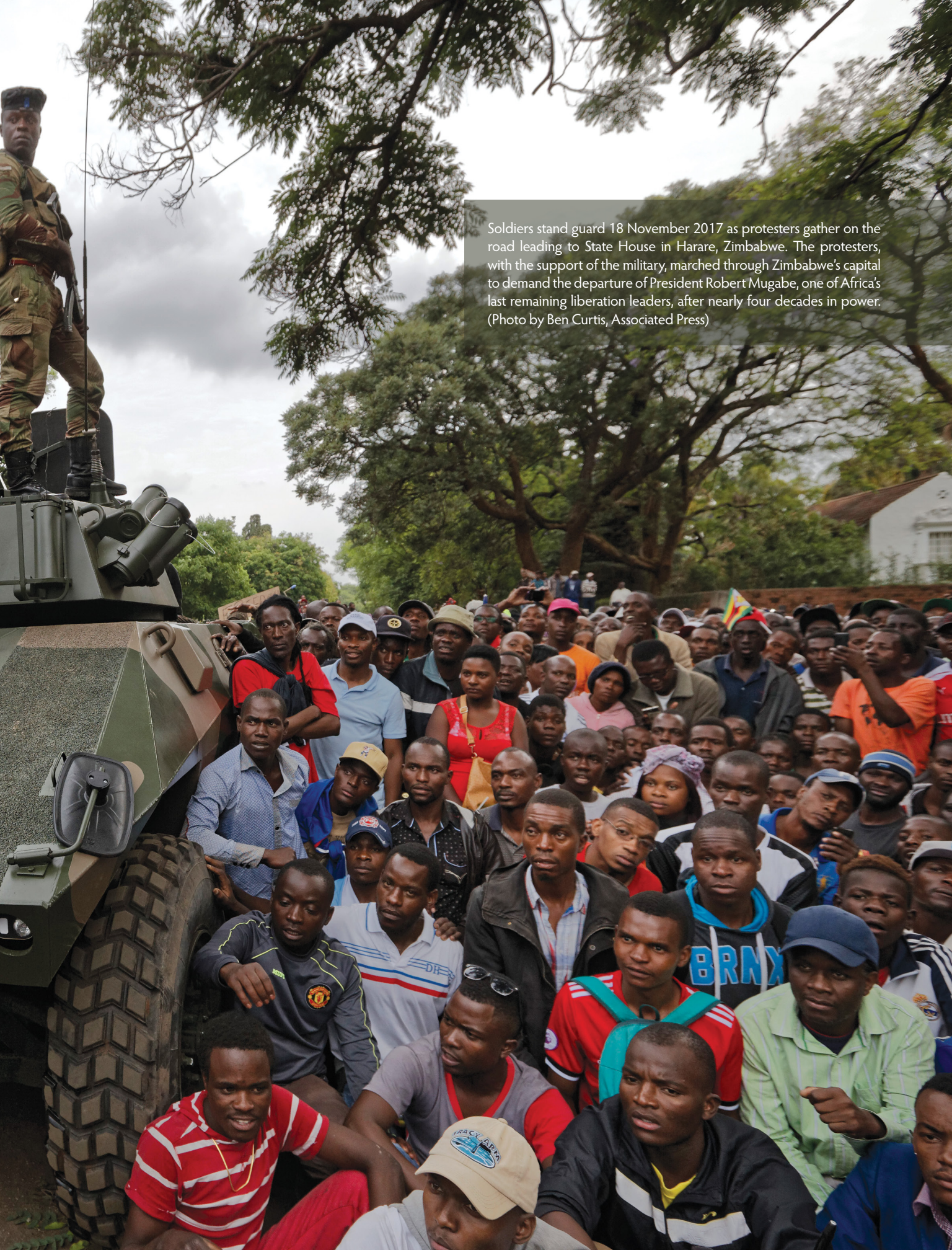
Soldiers stand guard 18 November 2017 as protesters gather on the road leading to State House in Harare, Zimbabwe. The protesters, with the support of the military, marched through Zimbabwe's capital to demand the departure of President Robert Mugabe, one of Africa's last remaining liberation leaders, after nearly four decades in power.