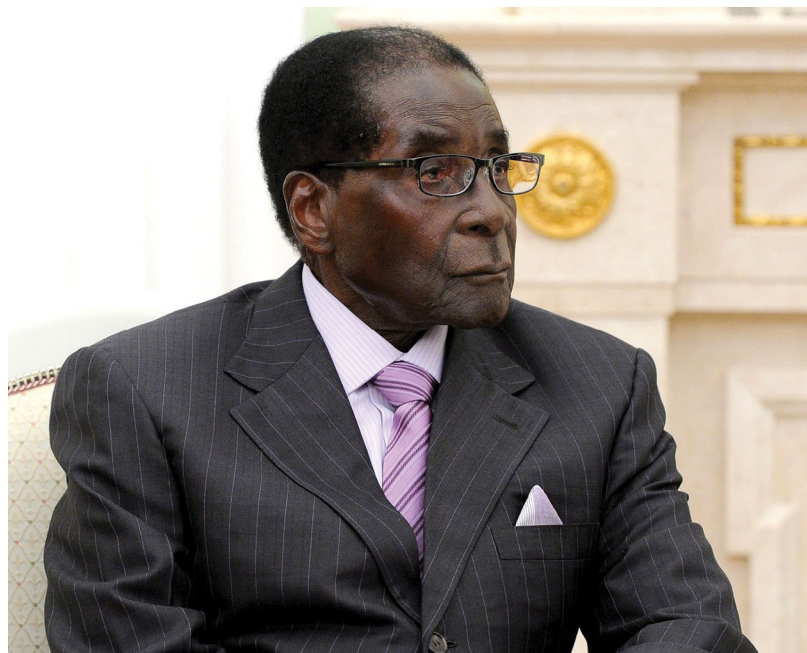
Robert Mugabe, then president of Zimbabwe and chairman of the African Union on 10 May 2015.