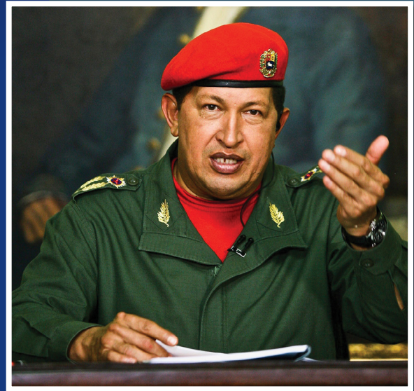
Hugo Chávez speaking 18 April 2010.

under the regime of Chávez, who are now deeply embedded in all aspects of the government security apparatus. As a result, the Cuban government now controls virtually every aspect of Venezuelan internal security including overseeing operations to eliminate the emergence of organized political opposition to the government. The conjunction of these factors, especially the dominant influence of Cuba on the government, is not well understood or appreciated by other nations concerned about antidemocratic developments in Venezuela. The Venezuelan kleptocracy is so well established that a successful military coup in Venezuela is extremely unlikely, whoever the titular head of the government is, and irrespective of the amount of suffering by the general populace of Venezuela. For articles providing insight into each facet of the domestic plight of Venezuela as described above, see Military Review Hot Spots at http://www.armyupress.army.mil/Special-Topics/World-Hot-Spots/Venezuela/ .