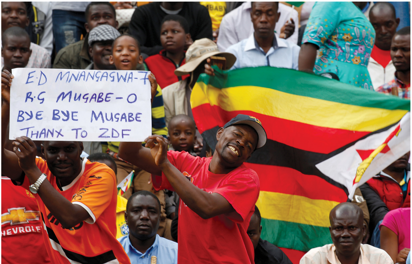
People wait in excitement 24 November 2017 for the inauguration ceremony to swear in former vice president Emmerson Mnangagwa as president of Zimbabwe in Harare, Zimbabwe.

NASA before drifting into law and the theories of governance. Thus, he enthusiastically crosses disciplinary boundaries to construct an analysis that draws extensively from classical wisdom on politics and post-Cold War case studies. Moreover, he executes this ambitious project with a lively and readable argumentative style, exploiting frequent references to popular culture.